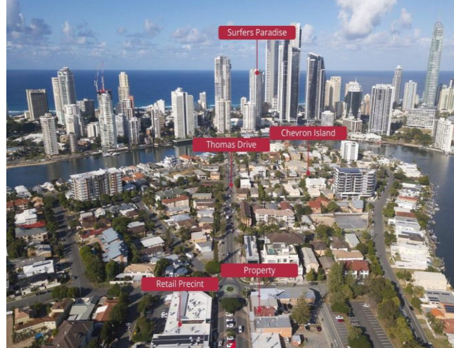
42 Thomas Drive, Chevron Island