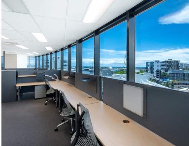
1805 / 56 Scarborough Street Southport