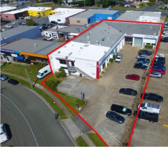
10 Strathaird Road, Bundall