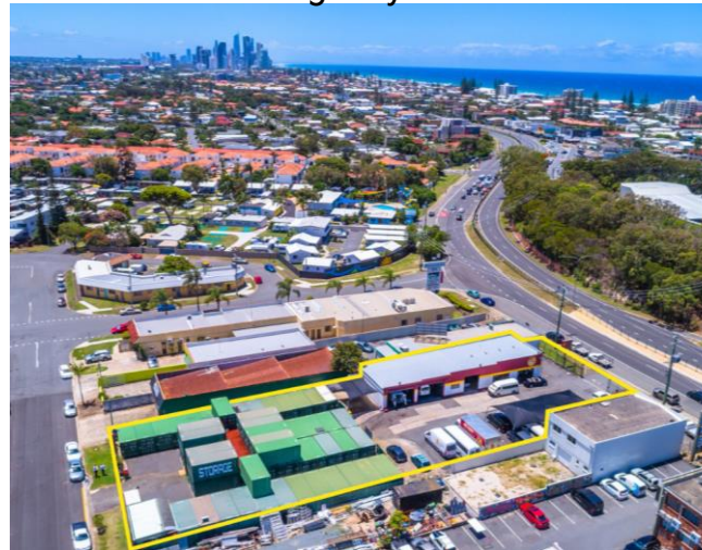
2182 Gold Coast Highway Miami