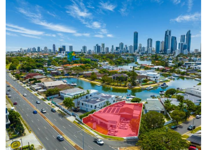
91 Bundall Road, Bundall