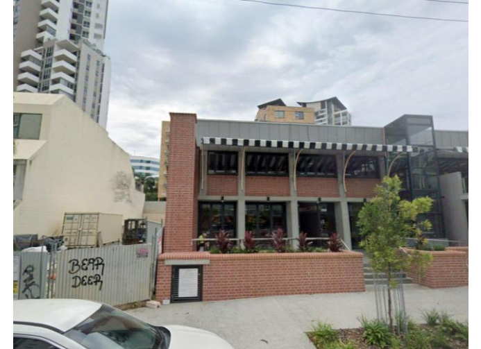
8 Welch Street Southport