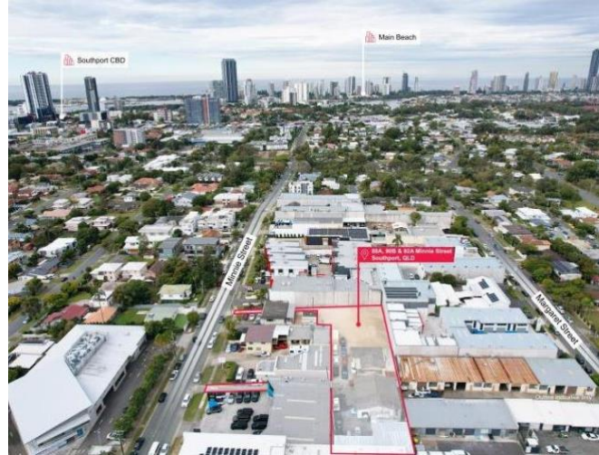
88A, 90B & 92A Minnie Street, Southport