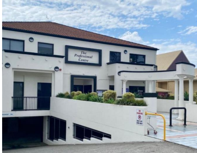
10/189 Ashmore Road Benowa