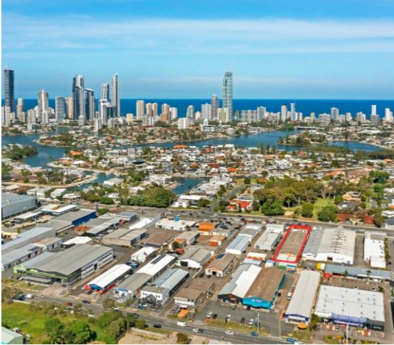
66 Bundall Road, Bundall