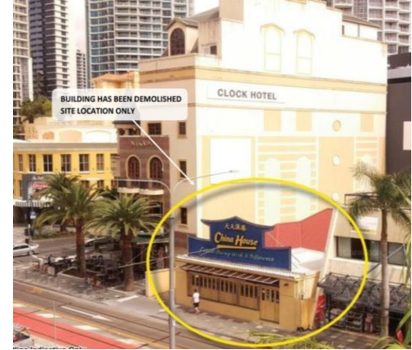
3286 Surfers Paradise Boulevard, Surfers Paradise