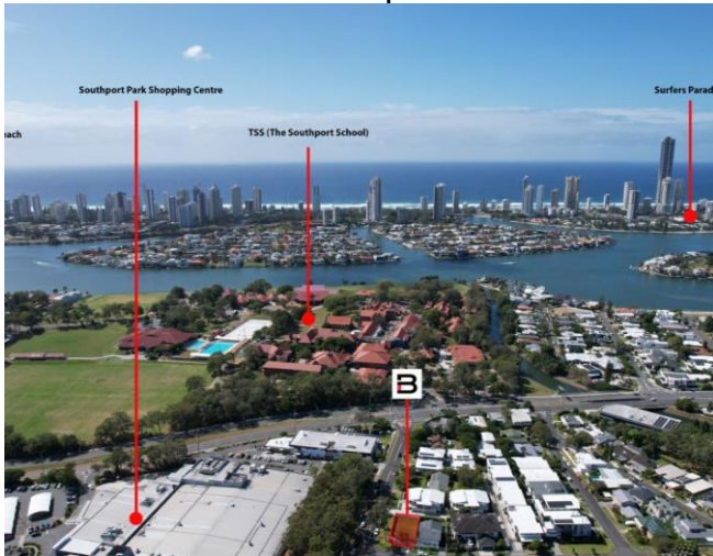
2 Petersen Avenue Southport