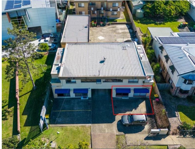
1/49 Nerang Street Nerang