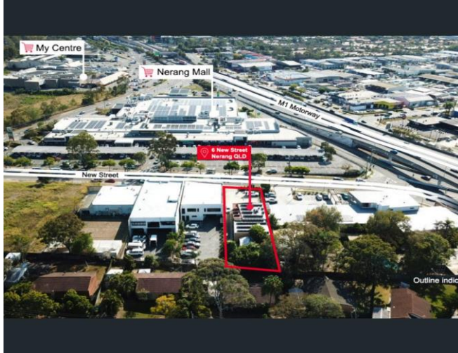
6 New Street, Nerang