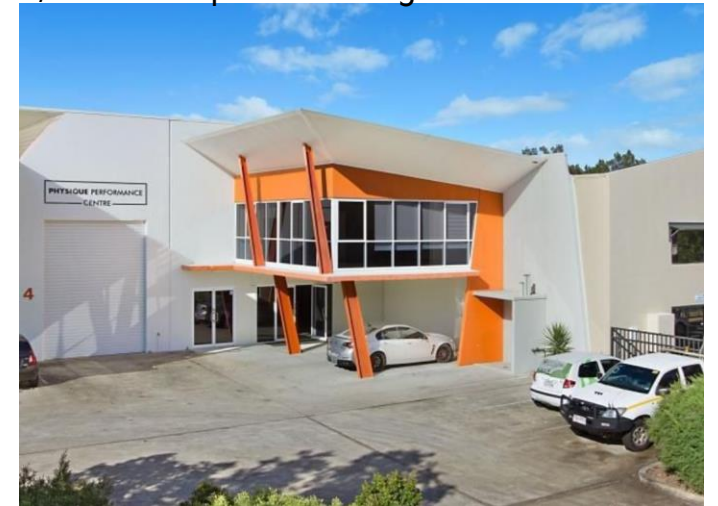
4/38 Township Drive Burleigh Heads