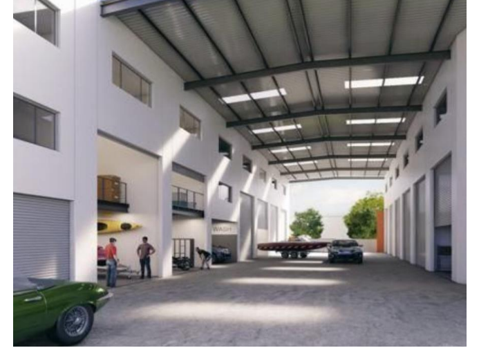
17/25 Industrial Avenue Molendinar