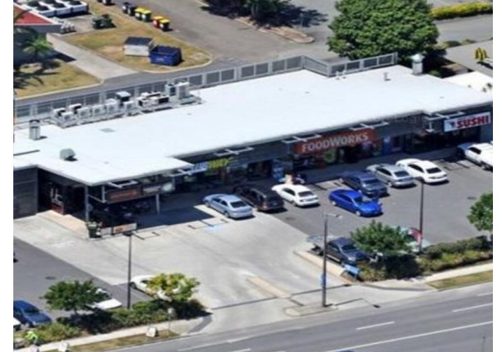
660 Toohey Road Salisbury