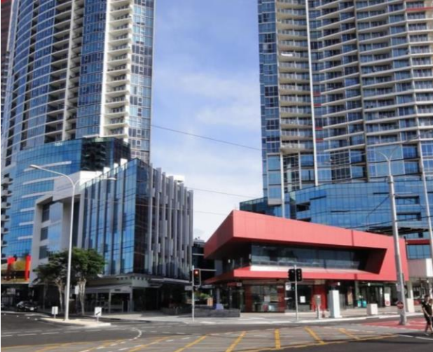
1705 / 56 Scarborough Street Southport