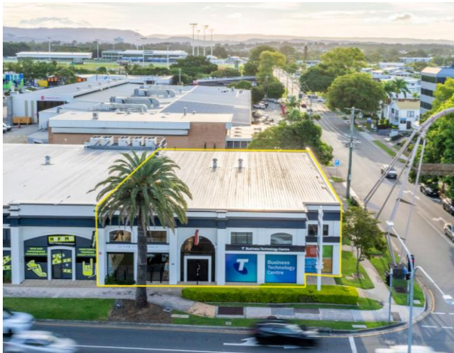
2/22 Crombie Avenue Bundall