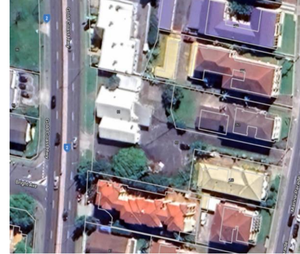
256 Marine Parade & 91-95 Frank Street Labrador