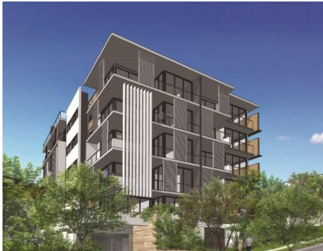
78 Brisbane Road Labrador