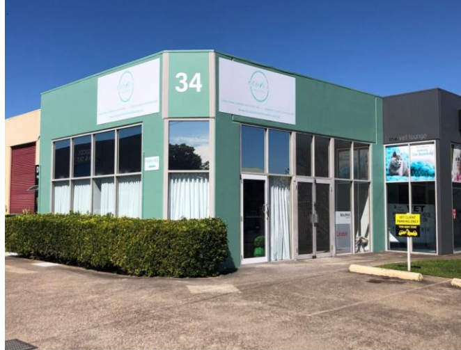
4 / 32-34 Currumbin Creek Road Currumbin