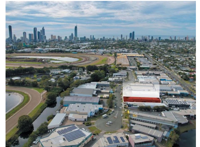
18 Strathaird Road, Bundall