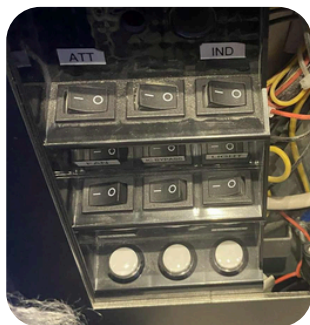
Use the lift key to open the switch panel