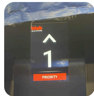
You should now be in priority mode

When you have finished please return the lift to normal service